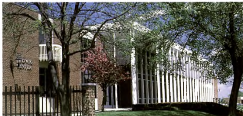
Ludwig Center, 1966

An artistic expression of Olivet's history and ideals by Harvey Collins