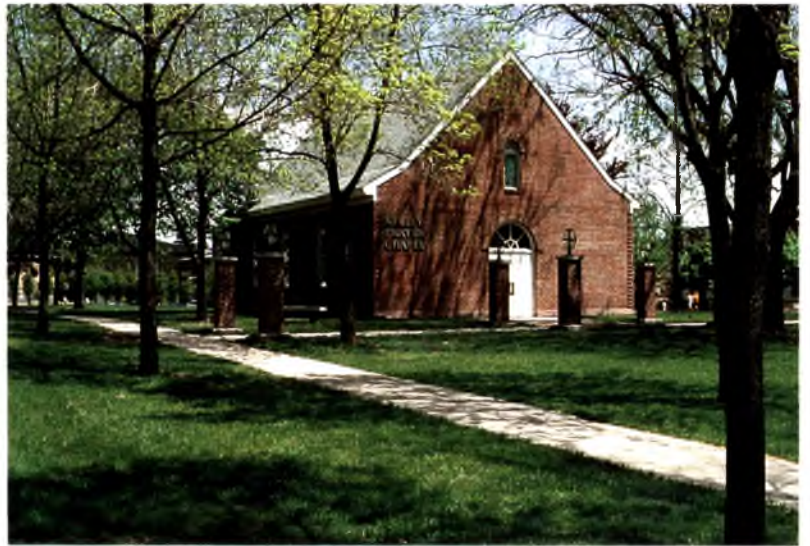
Kelley Prayer Chapel

Three rays of light descend from the Dove upon the scripture verse, joining it to the source of power, the Dove or Holy Spirit.