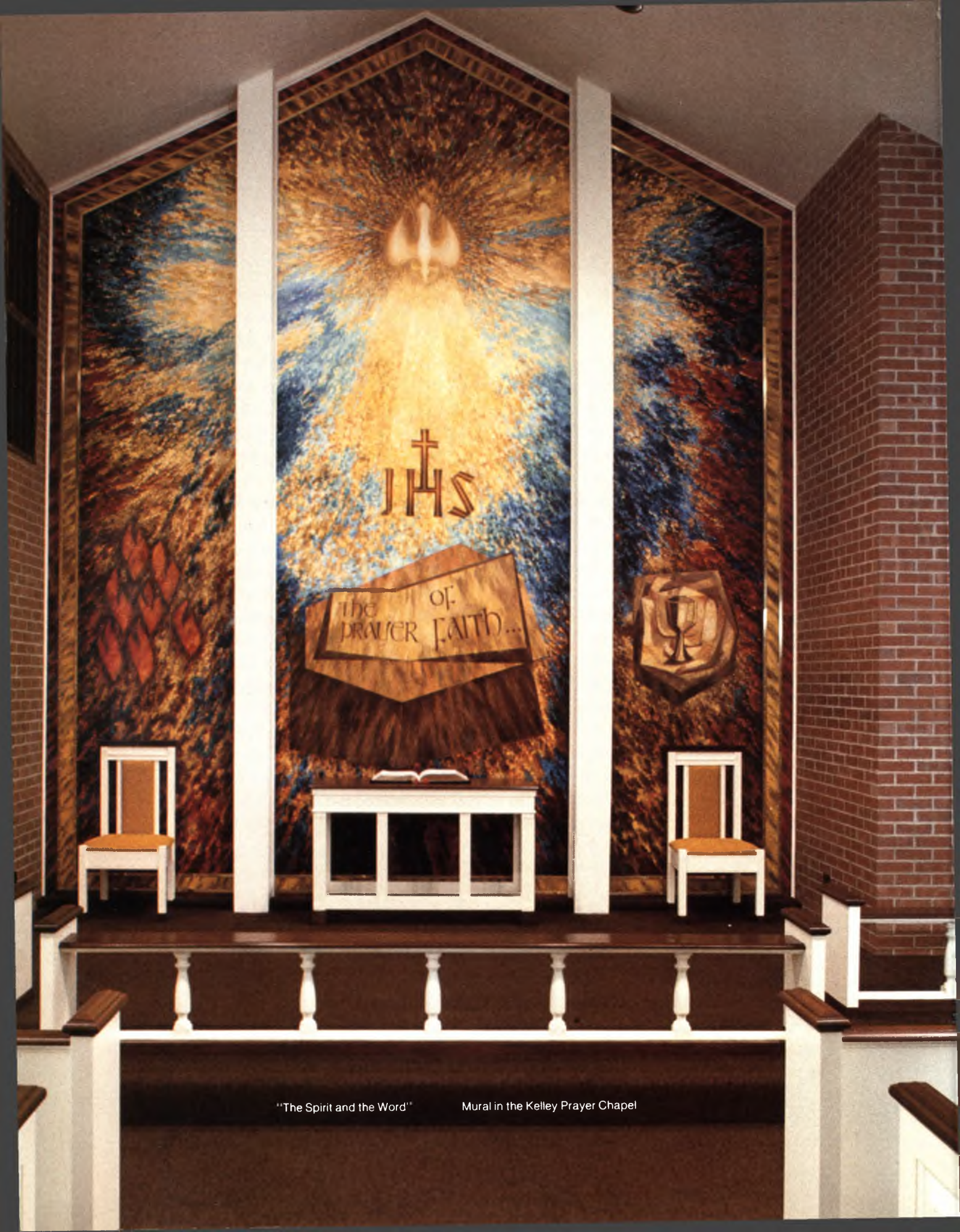
"The Spirit and the Word"