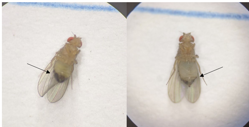
Figure 1a. Male drosophila fly. Notice the darker genitals and smaller size. 1b. Female drosophila fly. Notice the lighter, smooth genitals and larger size.

flies have been included in Figure 1. It should also be noted that female flies are typically larger than male flies, but because this can vary based on genetics, all flies were sexed by flipping the fly over and checking the genitalia.