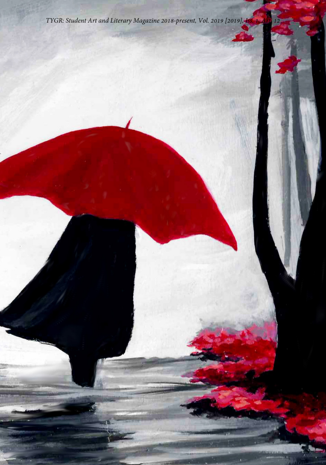
Rainy Day Reds | Abigail Baker | Acrylic on Wood Panel