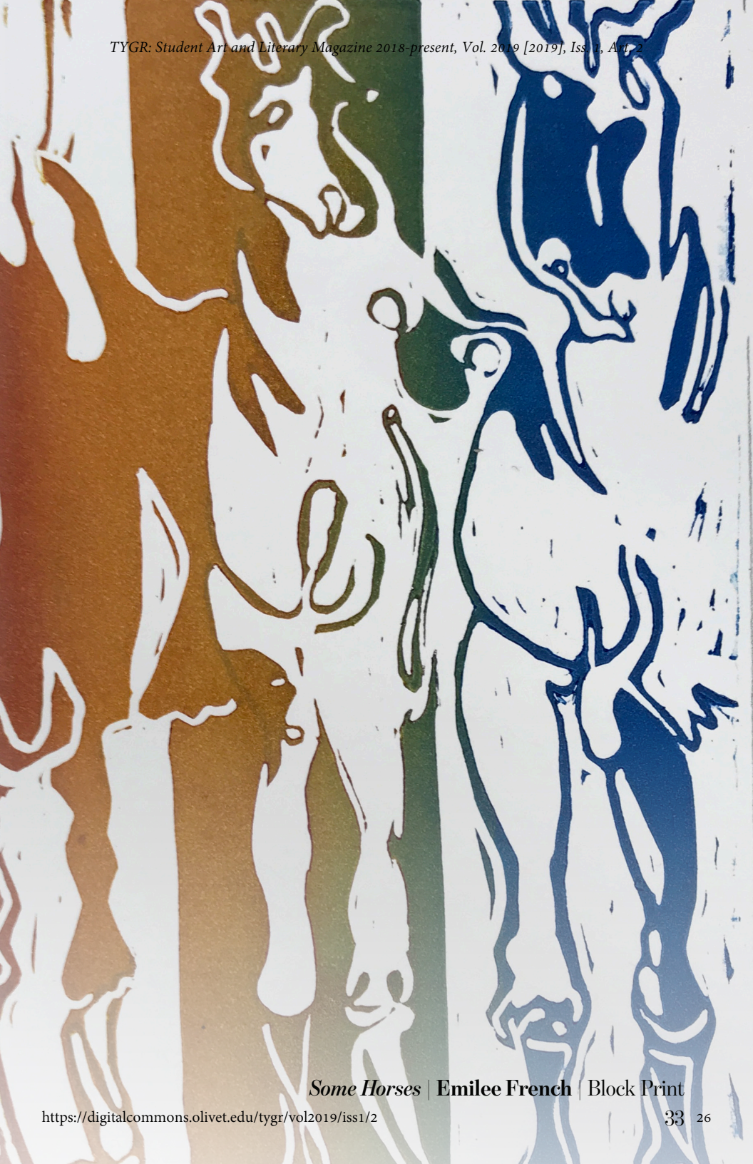
Some Horses | Emilee French | Block Print