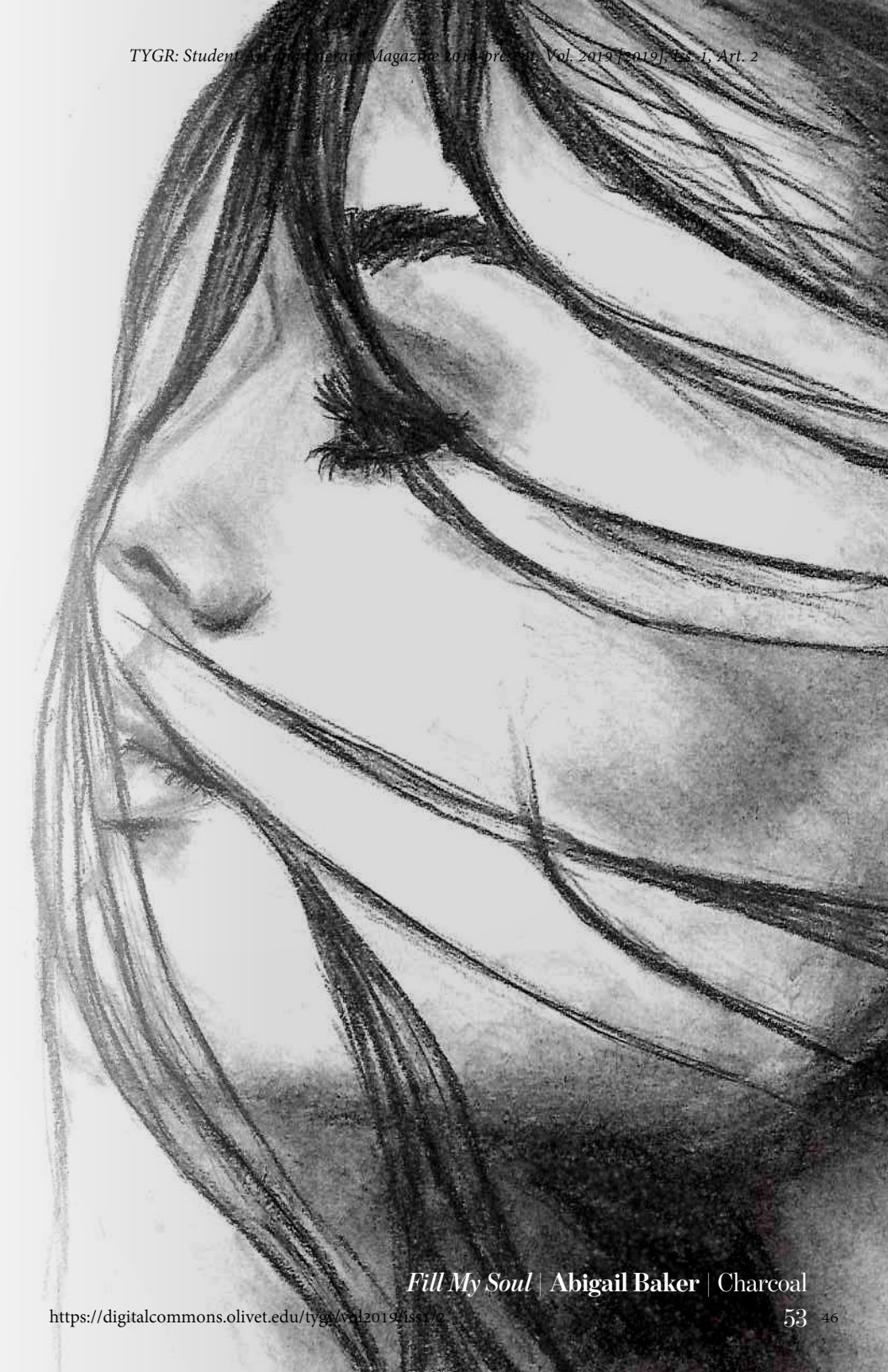
Fill My Soul | Abigail Baker | Charcoal