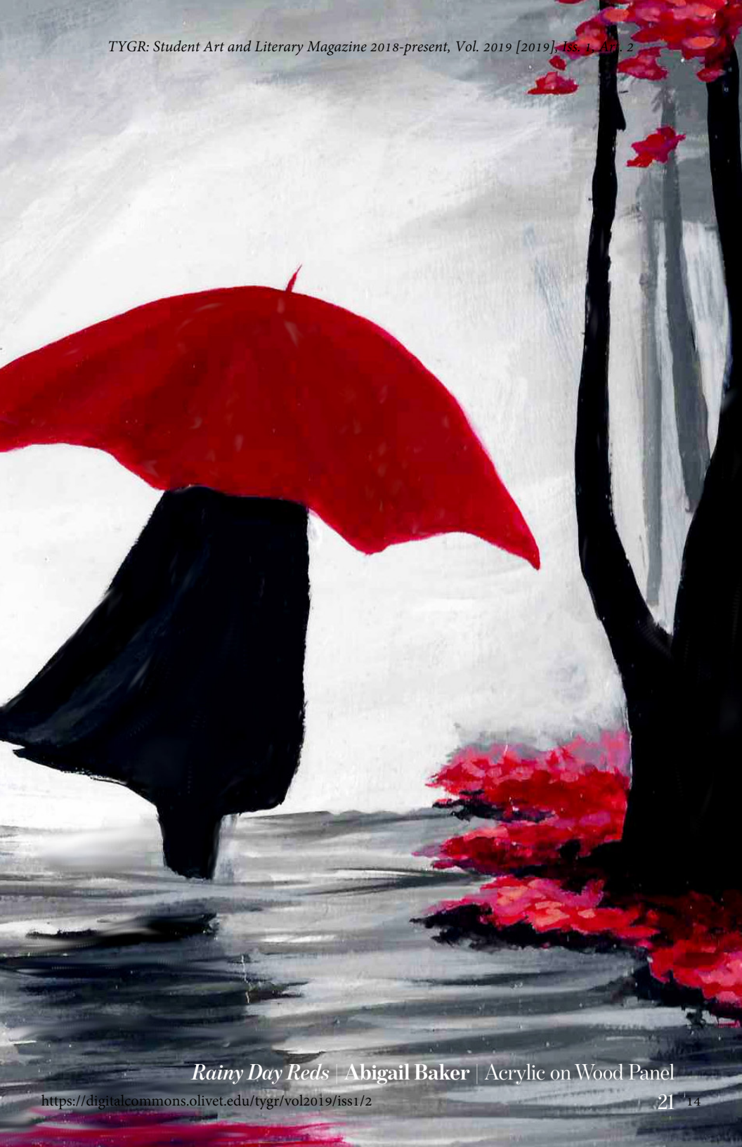
Rainy Day Reds | Abigail Baker | Acrylic on Wood Panel