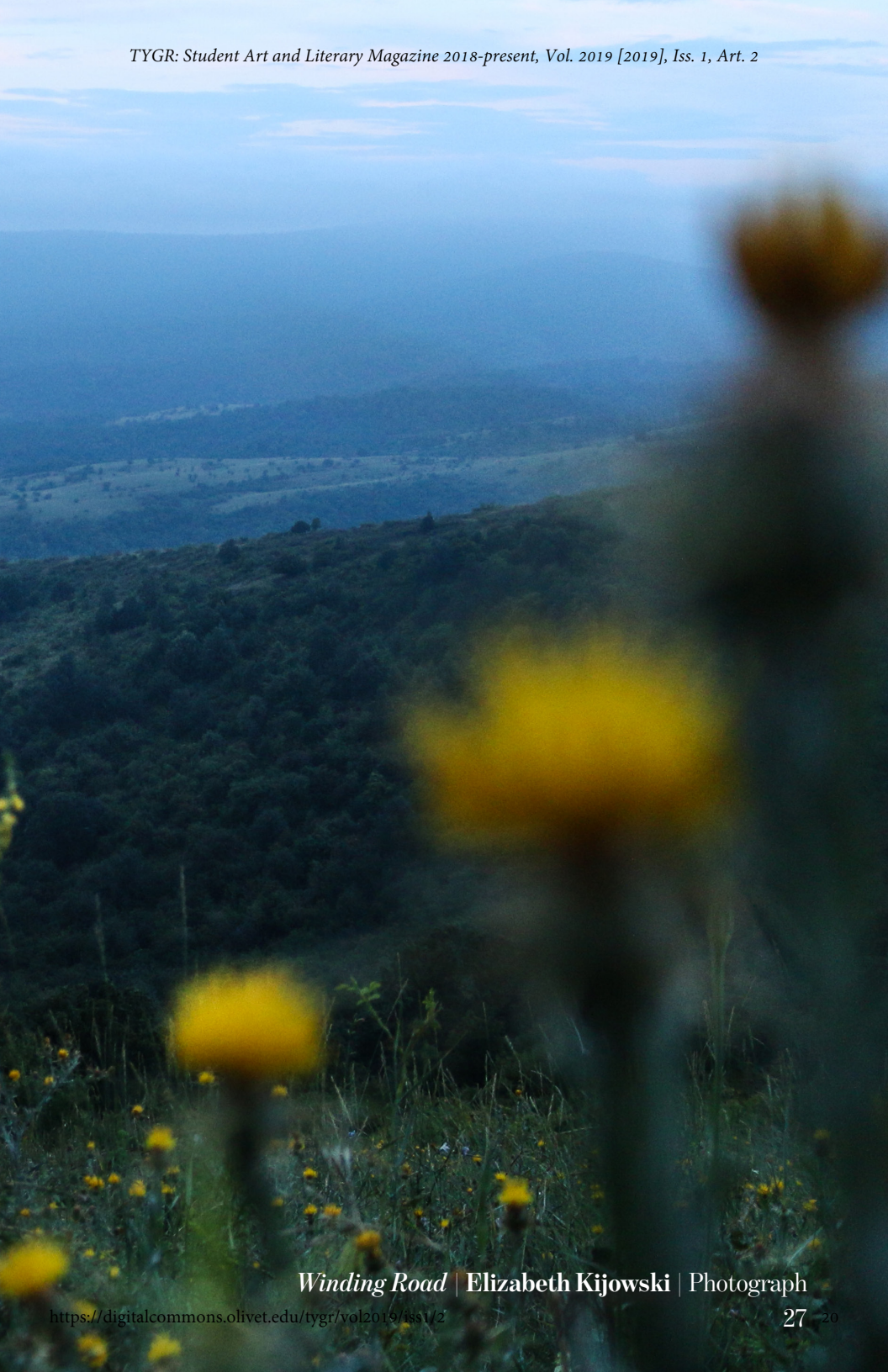
Winding Road | Elizabeth Kijowski | Photograph