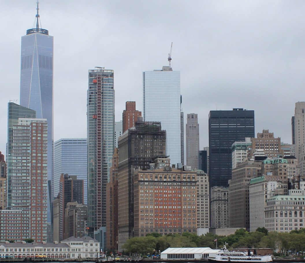
NYC Shoreline | Amberly C. White | Photograph

The stone is still and solid in my hand, Newton's law of motion not yet applied. I rub the water-worn surface against my palm. My arm pulls back, my wrist flips The stone jumps away, Skipping constantly like waves.