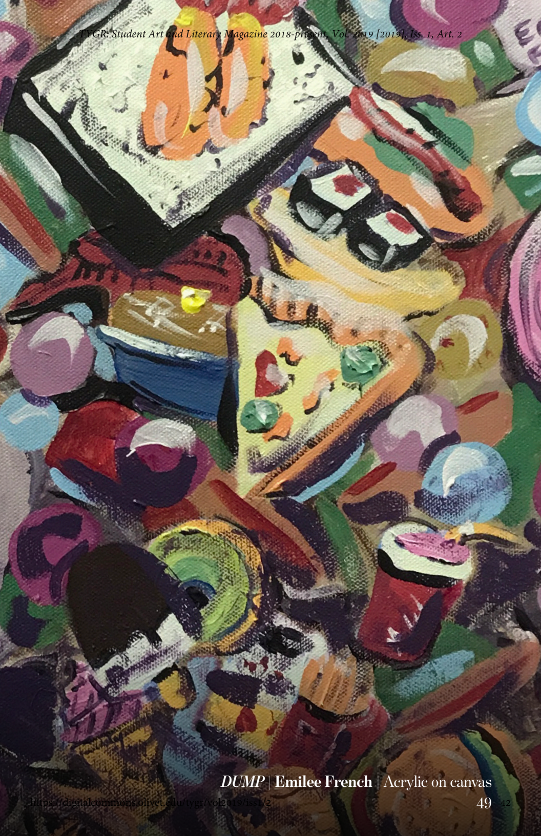
DUMP | Emilee French | Acrylic on canvas