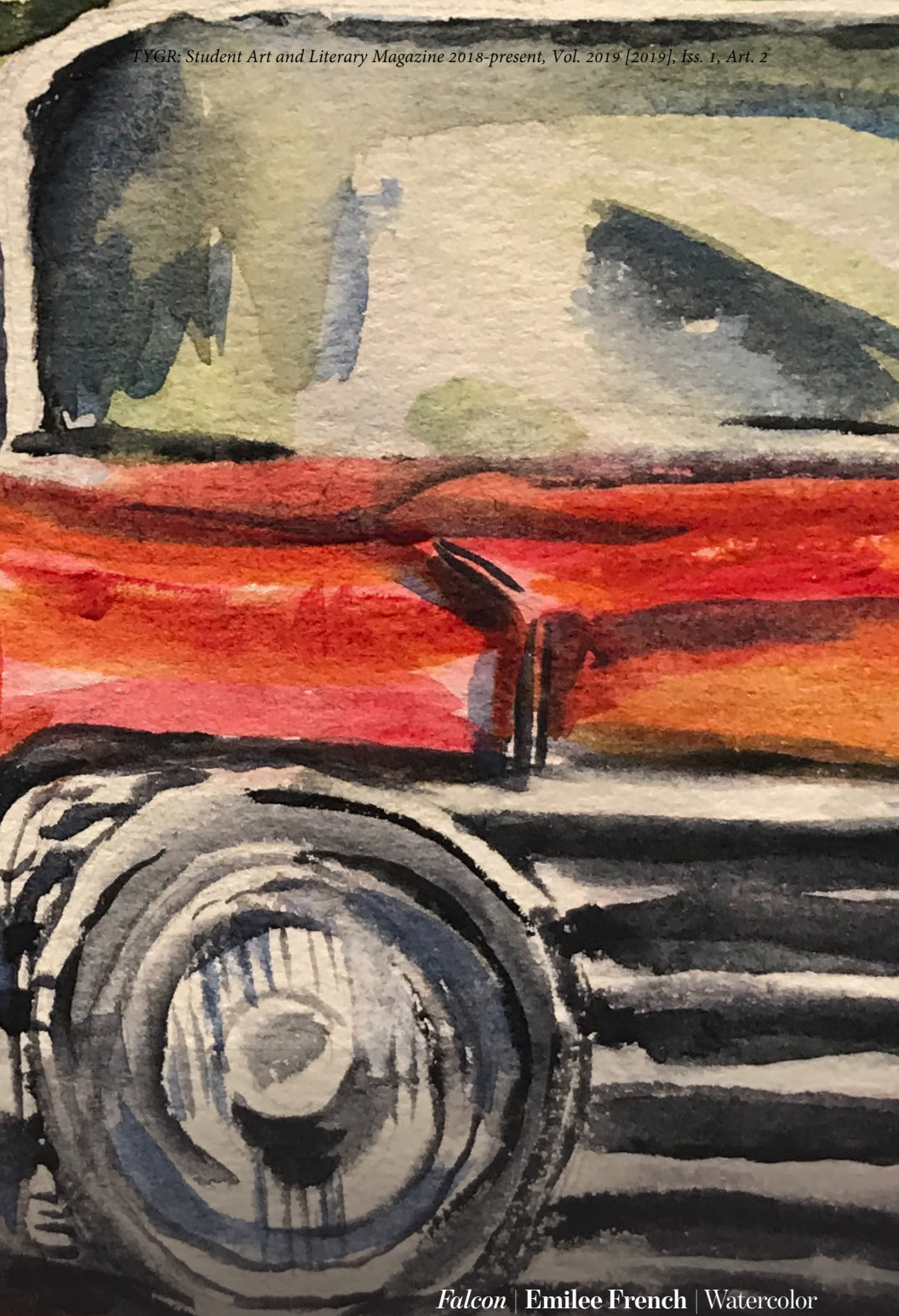
Falcon | Emilee French | Watercolor