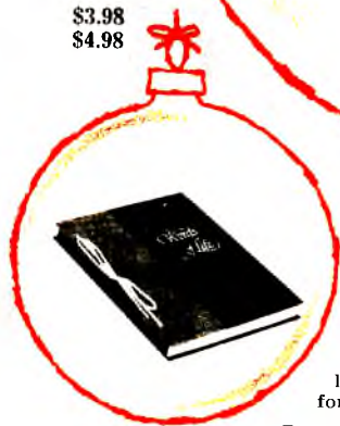
Sample of Print

in that and be on the reached old "the ding and ne LORD id, "I am raham thy od of Isaac: