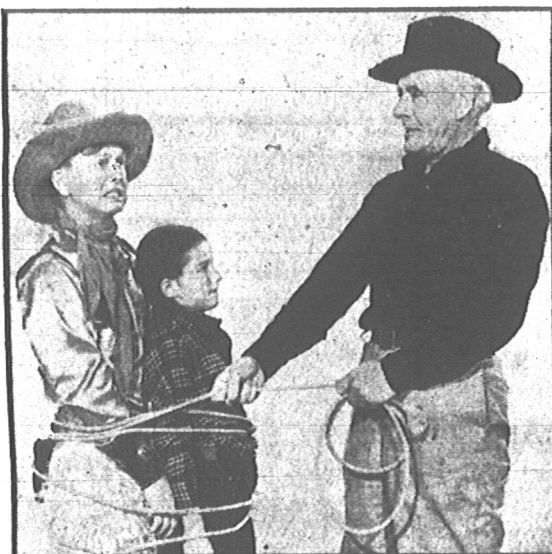
Opens Tomorrow at Darb

The three menaces of the screen, starting with a midnight preview Karloff, Lugosi and Rathbone, are tonight at the Luna and continuing combined in one horrific super Sunday through Tuesday.