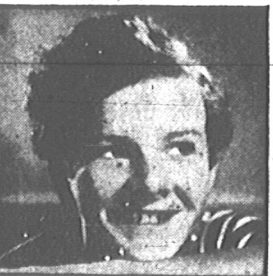
At Darb Tonight

Mickey Rooney and Lewis Stone, starring in "Out West with the Hardys" with the rest of the well known Hardy family appearing at the Darb theater in Manteno on Sunday and Monday. Continuous Sunday from 1:30 p. m.