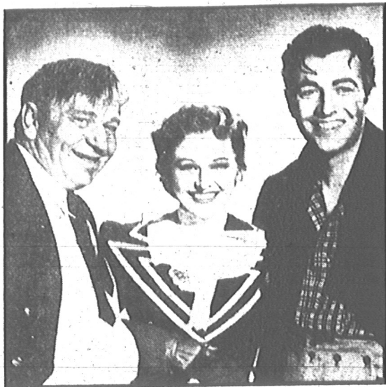
At Paramount Sunday