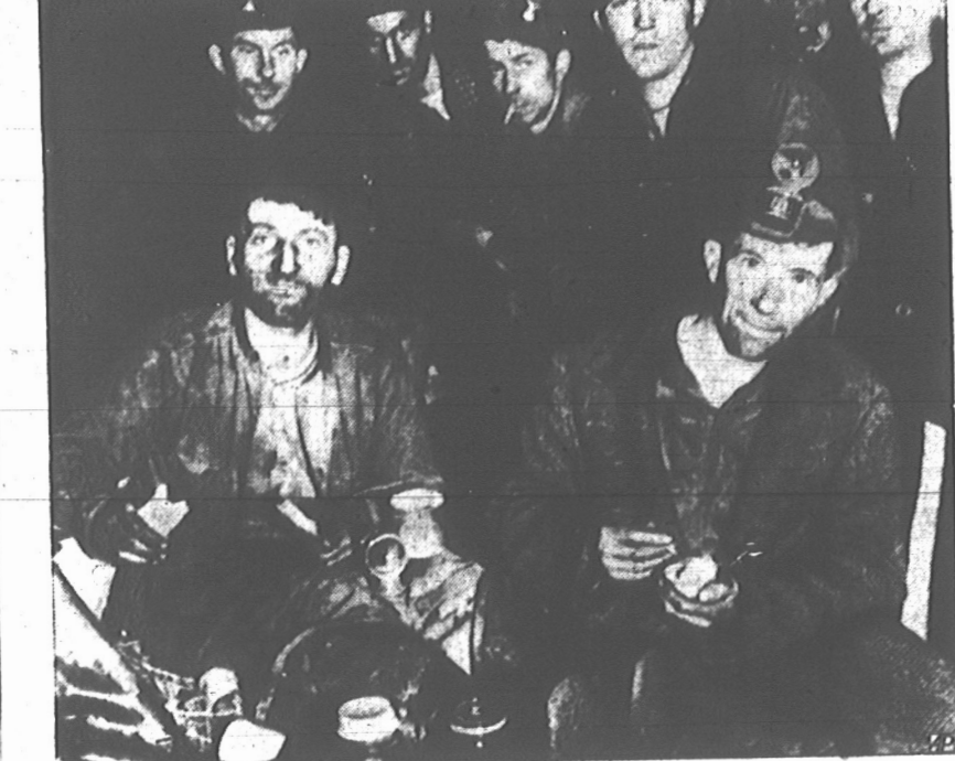
Miners Demand Back Pay, Stay In Shaft