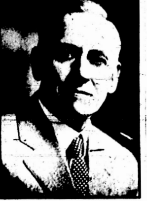
Honored by "Y"

Byrnes said that the bill would give the president the power to transfer the vast power which the war production act gave upon the president.