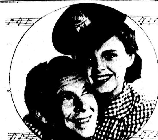
Opens Tomorrow at Manteno

Sunday and Monday "Cherokee Strip" Richard Dix. "D. K. Rife Goes Home" Lew Ayres. Tuesday Through Thursday "It Happened One Night" Claudette Colbert, Clark Gable. "Mr. Deeds Goes to Town" Gary Cooper. Friday and Saturday "Public Deb. Number One" Elsa Maxwell and Brenda Joyce and "Rolling Home to Texas" Tex Ritter. "Junior G-Men" Dead End Kids.