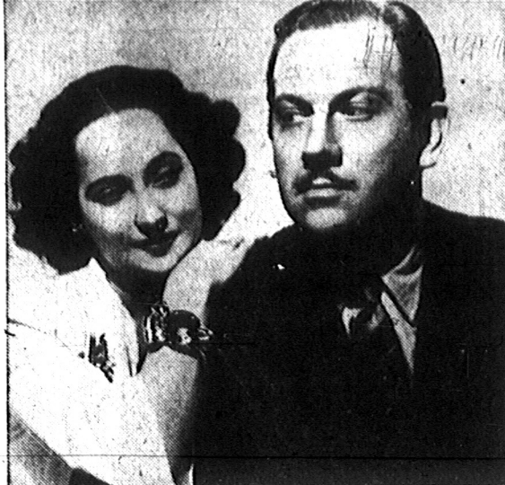
Co-Starred in "That Uncertain Feeling"

LILLIPUT GOLF IN JUNEAU Juneau, Alaska, Sept. 9—(UP)—Echoes from the past: A newspaper advertisement, lauding a new miniature golf course, described it as this city's "newest craze." Attendance was said to be thriving.