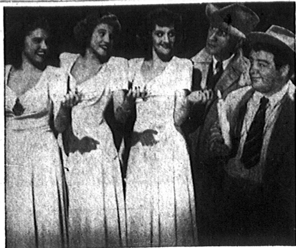
Abbott and Costello at Paramount

"We figure that 100,000,000 Americans can't be wrong, and so long