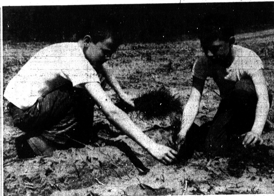
Scouts Plant Trees

NEED MONEY FAST To Consolidate Bills? Come in or Phone WE 3-4671 Kankakee Citizens System 198 SOUTH SCHUYLER AVENUE SINCE 1927