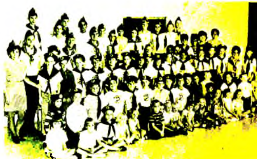
Alhambra Caravan group with guides