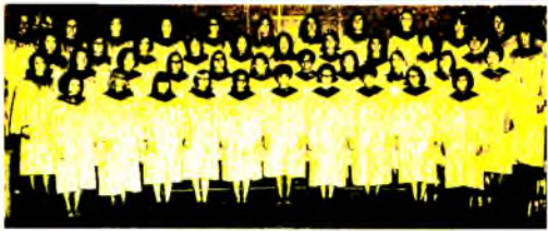
Treble Clef Choir