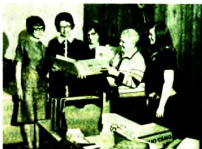
General NWMS Council plans and works

The General Council of the Nazarene World Missionary Society (NWMS) met in annual session, January 7-9, in Kansas City.