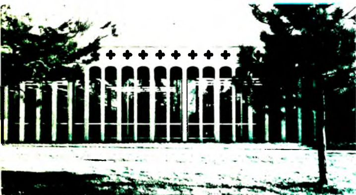
North end of library overlooking hillside