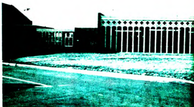
Entrance to library from parking lot