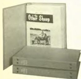
"Other Sheep" Binder

Keep your periodicals and departmental folders in these convenient BINDERS . You'll be able to locate that special article or departmental information in just moments.