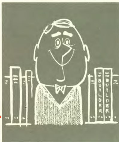
"Church School Builder" Binder

Exclusively for "Other Sheep"! Stiff board binder is covered with pleasing blue, levant-grained leatherette. Backbone imprinted in gold. Easily inserted steel rods firmly hold a year's supply. Size, 8 3/4 x 11 1/2". * S-204 $2.00