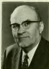
General Superintendent Powers