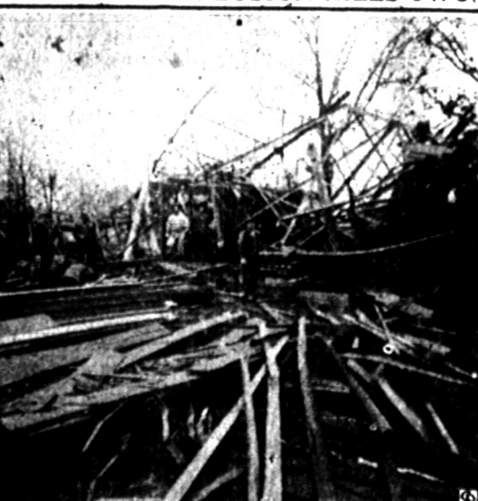
This is what happens when oil field boilers blow up. Two of them exploded near Kenawa, Okla., killing two men and injuring four others. The 85-foot steel derrick was torn out of its concrete foundation and dropped 100 feet away on a residence. The house was demolished and the lone occupant was injured seriously.