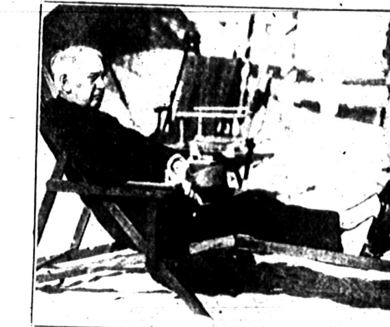
Frank B. Kellogg, former secretary of state, is among the prominent visitors to Florida winter resorts. He is shown here resting on the beach at Miami Beach.