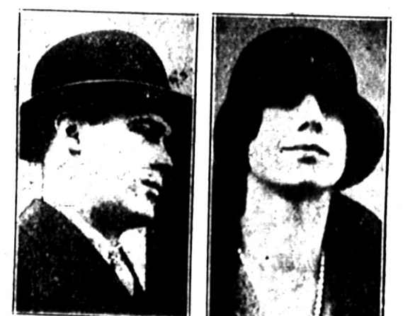
An interlocutory decree of divorce was granted to the former Princess Xenia of Russia by William B. Leeds, son of the late "big game" king, at Huntington, Long Island.