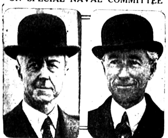
Charles F. Adams (left), secretary of the navy, and Ambassador Hugh Gibson were designated as the American members of the special committee appointed by the plenary session of the London naval conference to consider the question of how naval power is to be measured.