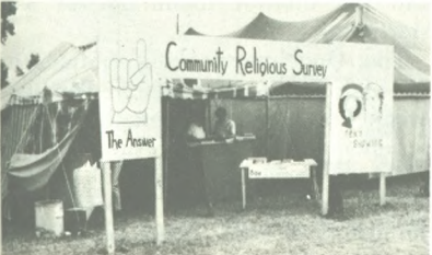
The tent used as a center for witnessing

The church set up a rented tent along the fairway of the Macon County Fair and found a way to extend their evangelistic efforts. Inside, a film on drugs was shown. The film pointed to Christ as the Answer to the drug problem. Outside, literature was offered and people were invited to sign up for a free Bible study course.