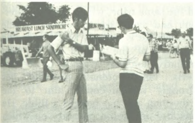
Conducting the religious survey

Trained interviewers conducted a community religious survey. People who showed an interest in salvation were invited inside the tent, where they heard the four spiritual laws explained.