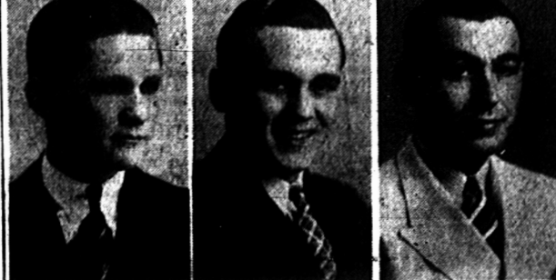
3 Bradley Pals Join Air Corps

The widow and the son are named executors.