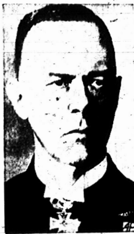
Leads Nazi Fleet

Admiral Gunther Luetjens (above) was the commander of the German naval forces which sank the British battle cruiser Hood, a Berlin communiqué said. The Hood was reported by the British and Germans as being sunk by the German battleship Bismarck in a battle off Greenland.