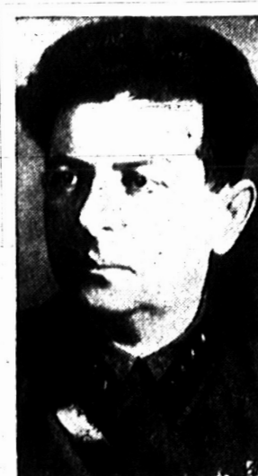
Resumes Red Office

L. Z. Mekhlis (above), former chief of the political department of the Red Army, was reappointed to that post and also appointed Vice Commissar for Defense. Mekhlis stepped down as army political chief when the political commissar system was abolished after the Finnish war. It was reinstated recently.