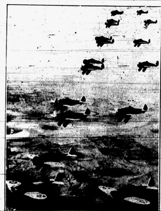
Virtually the entire general headquarters air force of the United States Army has been ordered to concentrate in California for the month of May to participate in maneuvers. Three thousand officers and enlisted men and 244 fighting planes will be used in the games. This Army Air Corps photo shows a squadron of pursuit planes in formation.