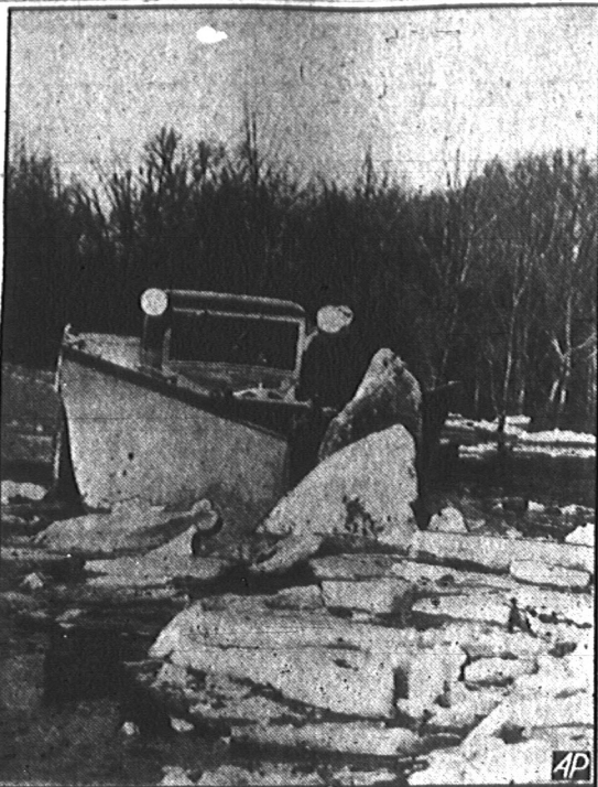
Snow Plow Takes to Water

A new innovation is the installation of a glass composition nose in new transport planes. Inside the "cage" the radio loop antenna is housed. This is said to reduce static, especially during the winter months.