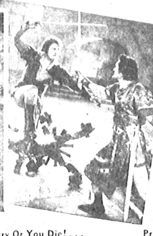
Parry Or You Die!...