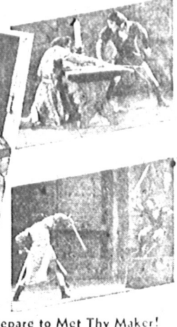
Prepare to Met Thy Maker!