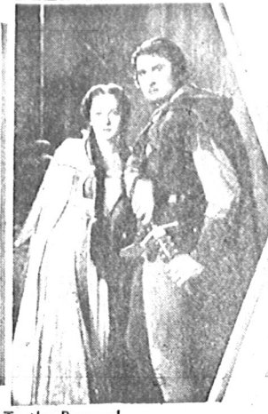
To the Rescue!...

The gay, swashbuckling Robin Hood (Errol Flynn), ever alert to protect the lady of his heart, (Olivia de Havilland) is confronted by the villainous Sir Guy of Gisbourne (Basil Rathbone). Robin proceeds to show the rogue that he is just as great a fighter as he is a lover. Here we see them ardently engaged in the main art of fencing, one of the many exciting scenes from "The Adventures of Robin Hood," a Warner Bros. Technicolor production, which comes to the Paramount theater starting Sunday.