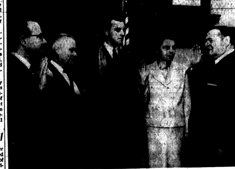
Kankakee County Officials Assume Duties

Downtown store hours for downtown will be 9 a.m. to 5:30 p.m. Seasonal decorations adorn light poles in the downtown area. The decorations, displayed in Kankakee for the first time, were provided by the Downtown Council.