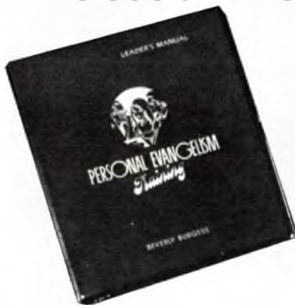
Personal Evangelism Training— Leader's Guide HHS-2600 $24.95