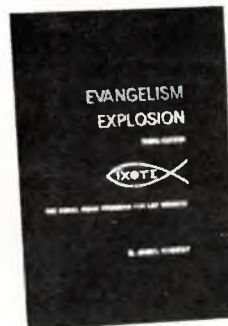
Evangelism Explosion HH084-230-7788 $9.95