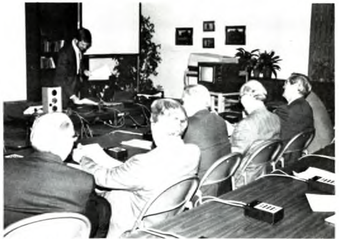
Members of the Board of General Superintendents receive a demonstration of the electronic balloting system that will be used at the 22nd General Assembly.