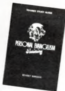
Personal Evangelism Training— Trainee Study Guide HH083-411-058X $6.95