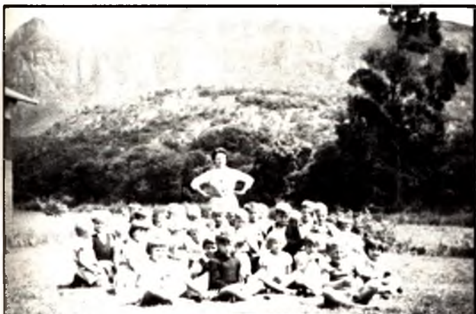
(Above) Reflections from the missionary subculture: school children in 1954. (R.) Organizing for service: a council meeting at Bremersdorp (undated).