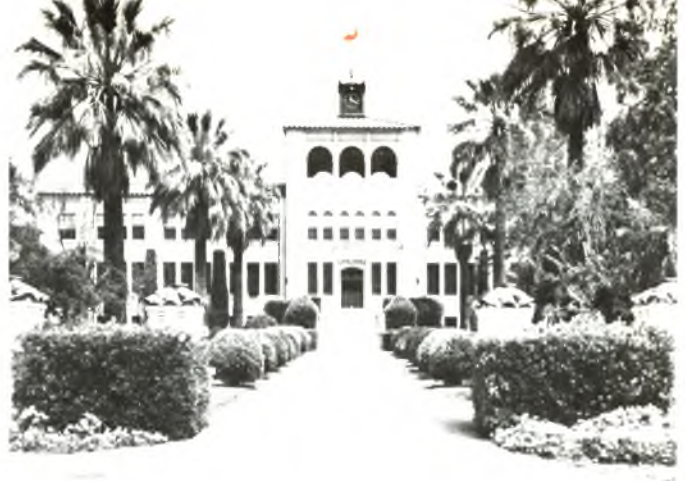
Former Pasadena campus