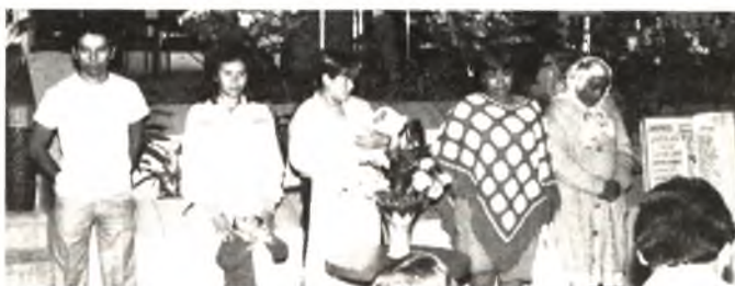
Some of the people who were brought to the Lord in one of the house churches