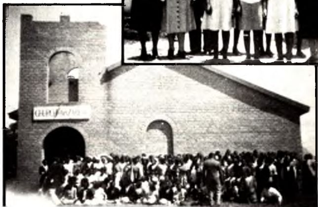
(Above) Camp meeting at Arthurseat, 1952-53.