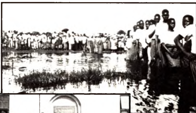
(Above) Baptismal service in Mozambique. (L.) Faces of the Christian vanguard: preachers of the Stegi district (undated).