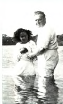
Baptizing in the Tweed River