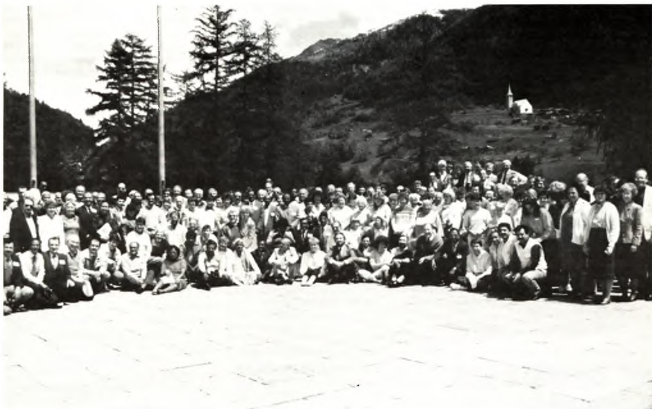
The group of around 230 people who attended the regional conference from the 19 districts of Eurasia