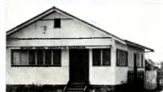
Bethany Chapel, located at Parry's Estate