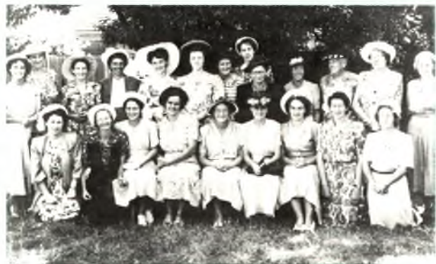
First NWMS delegates, 1950