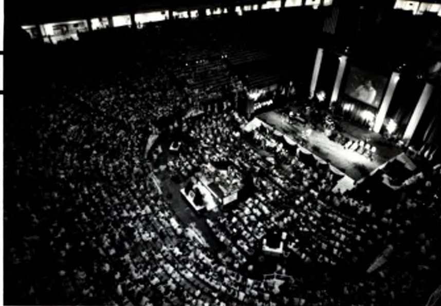
One of the indoor sessions at NYC '87