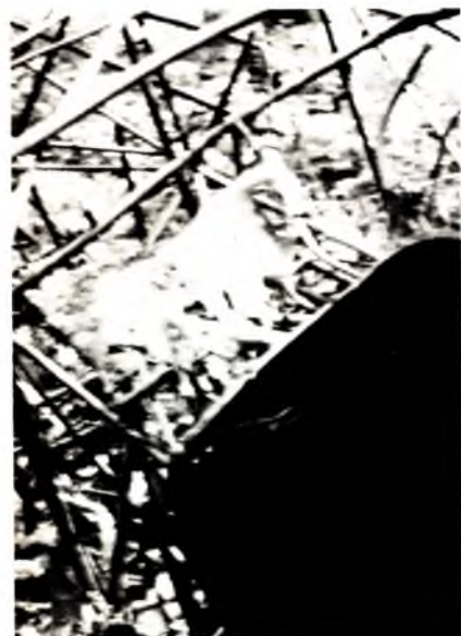
All that was left of the plane (top). The middle of this photo (above), where some white covering on the seat can be seen, is where the Bakers were sitting.

They have been “tried with fire,” but their faith continues to shine brighter than the “gold that perisheth.”