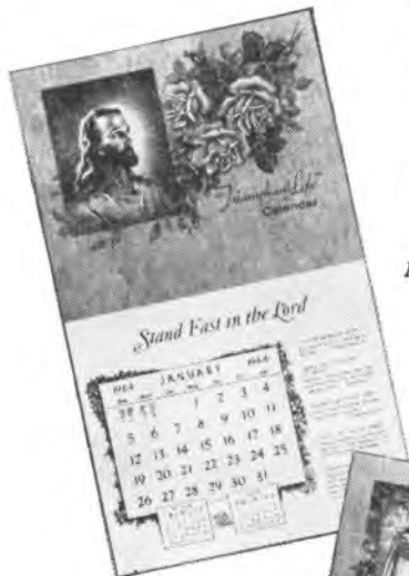
Head of Christ No. U-9000

Motto-style calendar artistically designed and highlighting three of Sallman's famous paintings in rich full-color. Something all will gladly accept and use as a source of inspiration throughout the year.