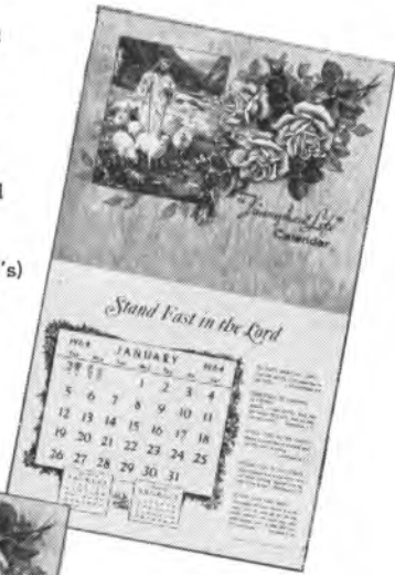
Assorted (in 100's) No. U-9064