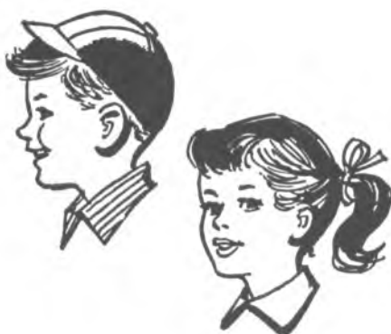
Angelic Children . . .

We love them all. They are OUR children and a very important part of our church family. We will honor them on Children's Day, June 12. This provides a wonderful opportunity to give recognition for the contribution they make to the church. This is a good time to impress upon them that they, too, are stewards and that God needs the service they can give.