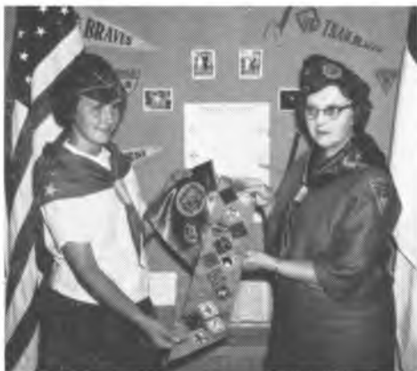
Upland First Church Award Ceremony, Upland, California

To motivate progress, conduct two award ceremonies each year.