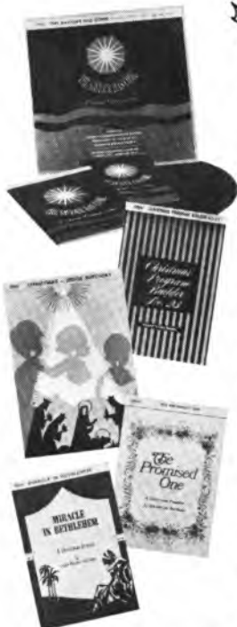
Prices slightly higher outside the continental United States

Examination copies available to any program director or choir leader requesting them.