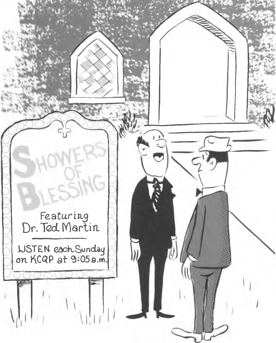
"Wha'da ya think? Is Kansas City getting too commercial?"