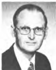
by Robert E. Maner

The more people we have, the less prominent any one person becomes. When a church of 40 suddenly jumps to 80, competition for the limelight