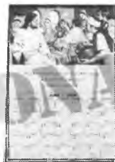
1978 Memo Moderne