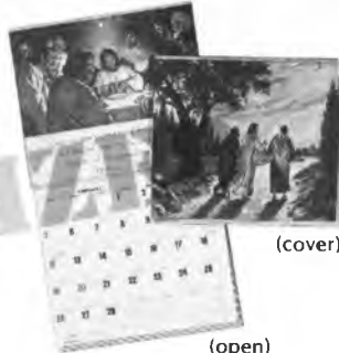
1978 Point Ment