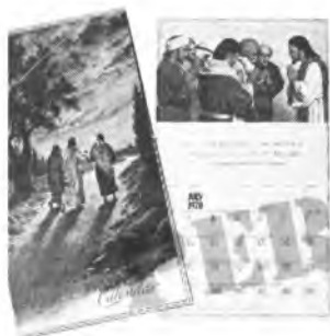
1978 Scripture Text