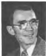
by C. Neil Strait

*From the New American Standard Bible , copyright © The Lockman Foundation, 1960, 1962, 1963, 1968, 1971.